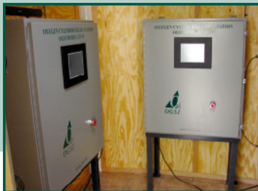
OGSi Model CFP-15's inside the trailer.

Louisiana Rural Ambulance Alliance Winnsboro, Louisiana