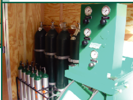
HYPRES fill containment, cascade and manifold.

The trailer is outfitted with the following equipment: