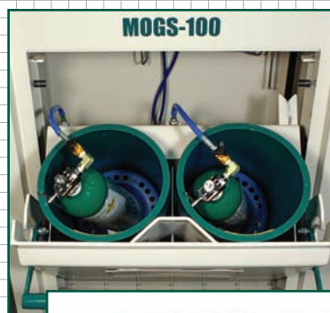
Dual Fill Containment